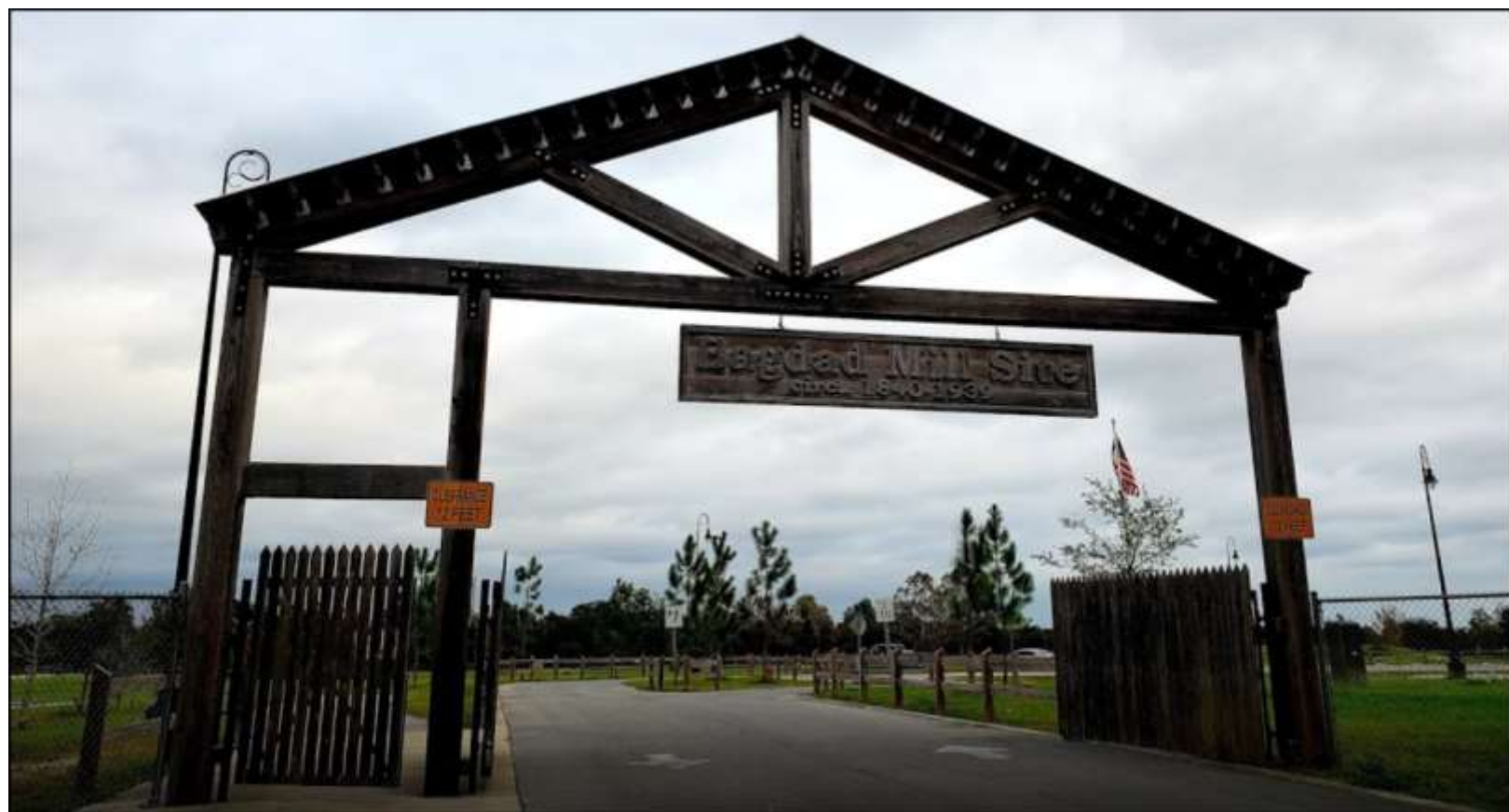
The Bagdad Mill Site Park Entrance