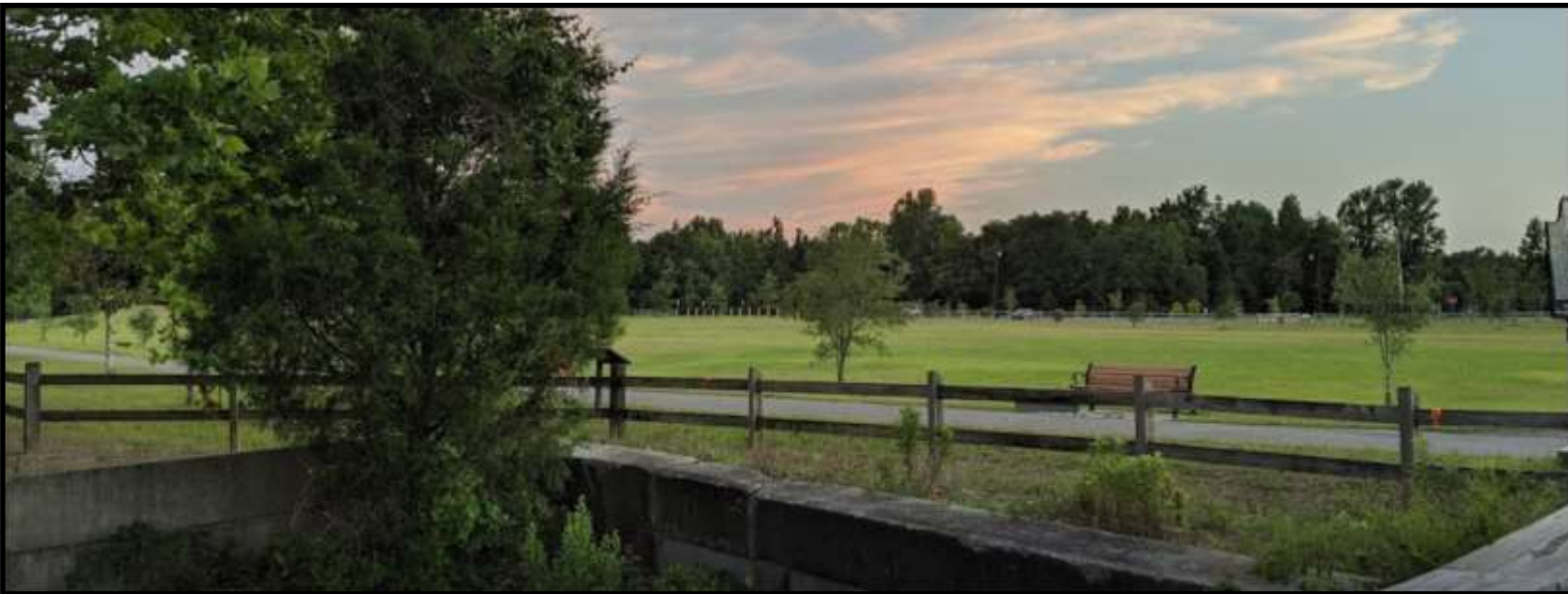
The Bagdad Mill Site Park