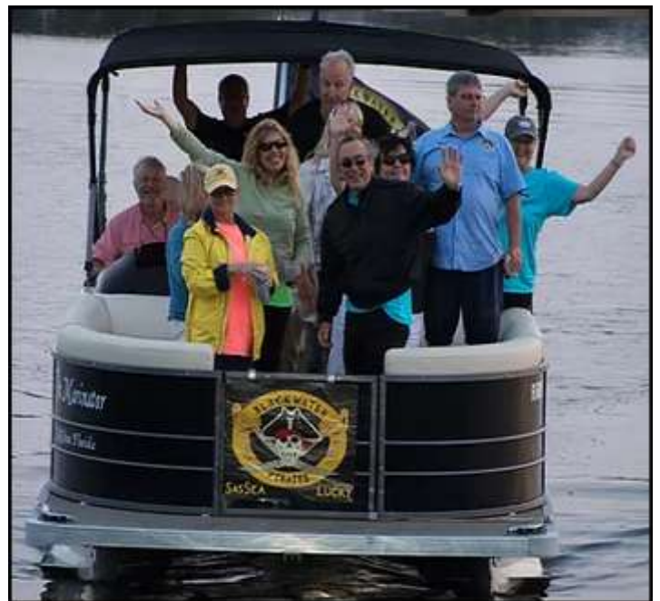
The Marinator (SasSea and Lucky’s boat) was used to shuttle Pyrates across Ward Basin to the New Member Party