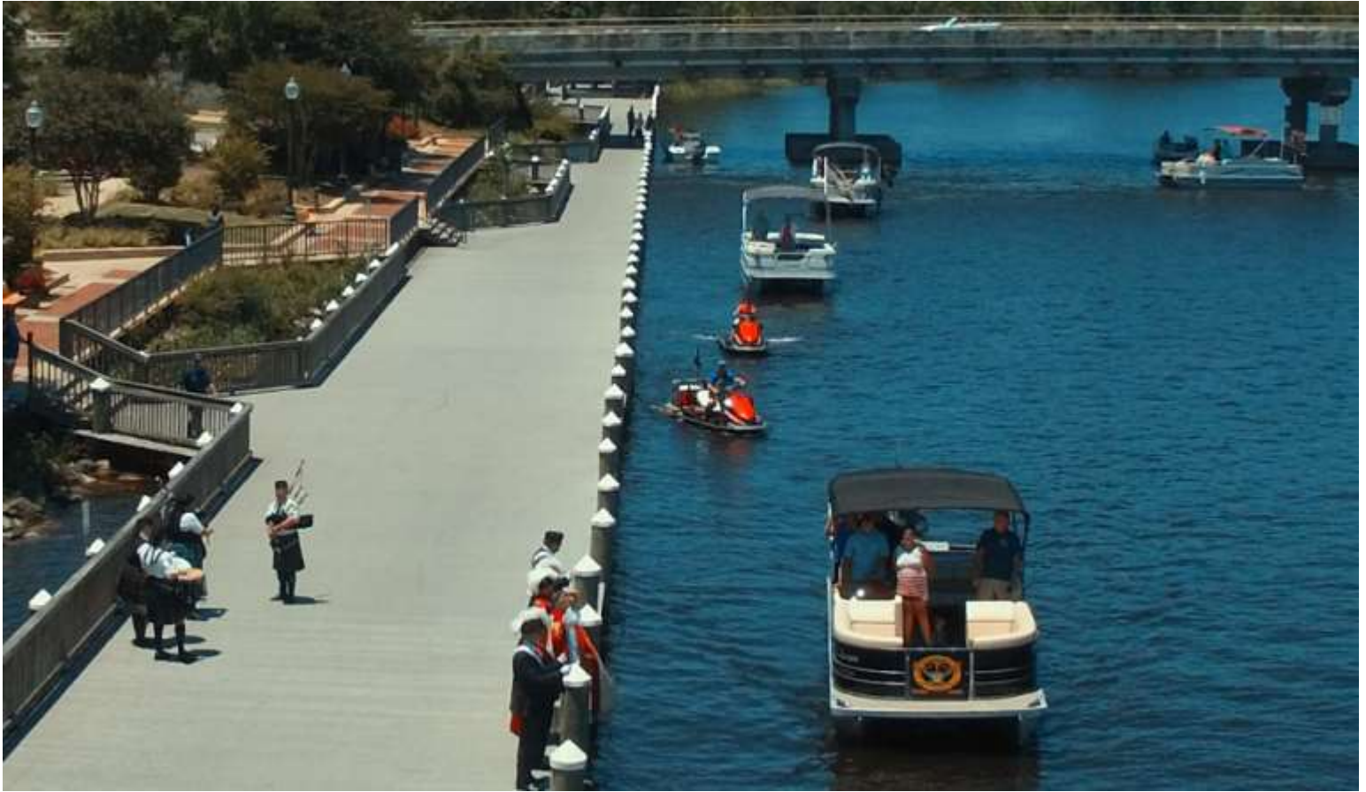
Vessels of all shapes and sizes line up on the Blackwater River near the Hwy 90 bridge (Caroline St) for the annual Blessing of the Fleet.

Although not directly associated with the Blackwater Pyrate core missions, the annual event of the Blessing of the Fleet coincides with Boater Safety Week and provides our Pyrates with the opportunity to share with our community a tradition passed down to all sailors.