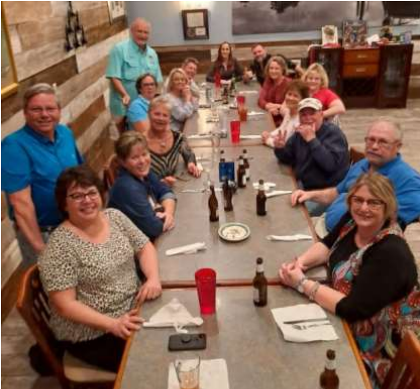
Can you name this group of rascals? The answer is at the end of the newsletter.