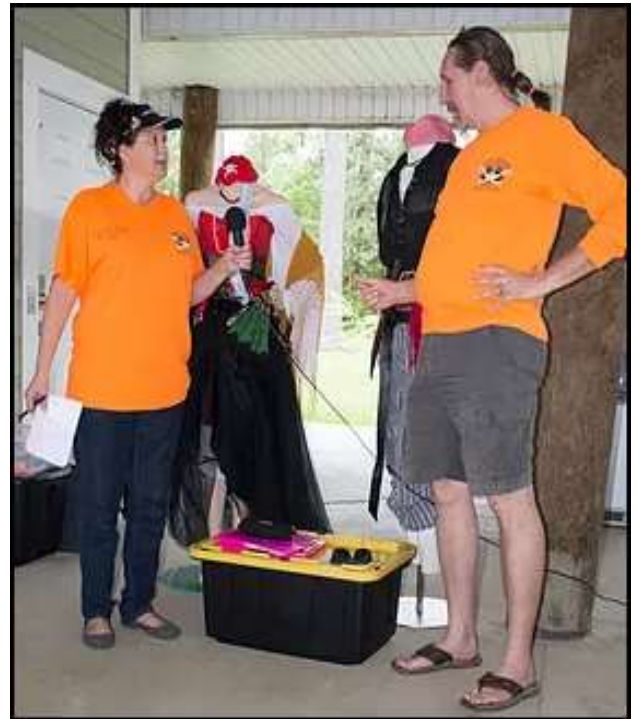
Full Throttle and Two Sox discuss appropriate Pyrate attire and where it can be purchased

Even some new Pyrates joined in the “show and tell” portion of the celebration by showing off their Pyrate attire and telling everyone where it could be purchased. Some of our more creative Pyrates provided instructions in “pyratizing” your own clothing or even how to create your own from scratch. The event is always fun, educational and entertaining.